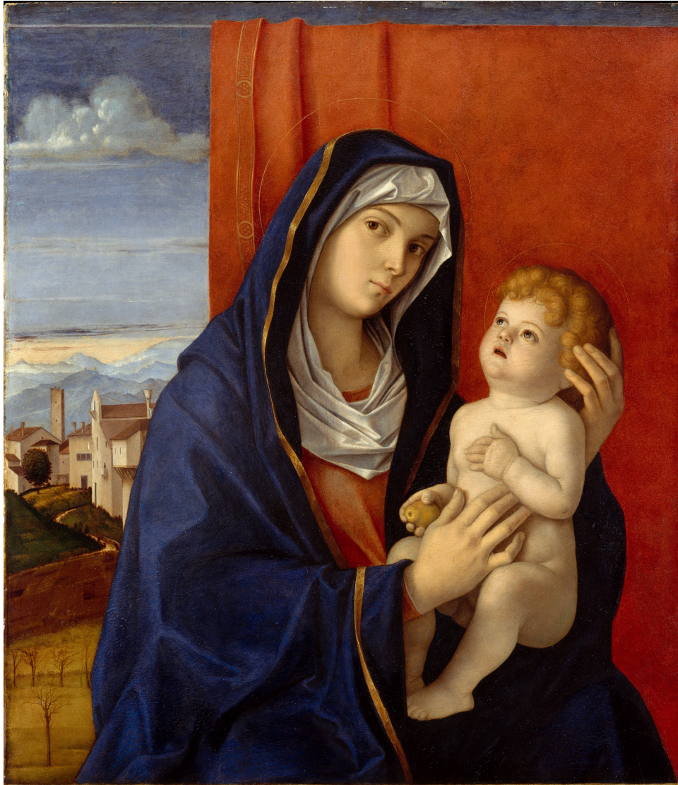
Madonna and Child, Giovanni Bellini, c. 1480

THE CATHEDRAL OF SAINT PAUL BIRMINGHAM, ALABAMA DECEMBER 25, 2023